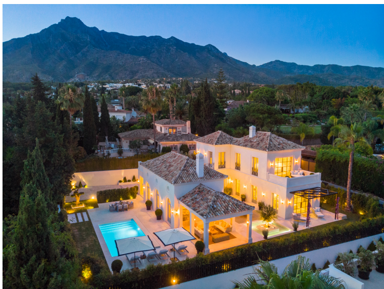
VILLA IN NAGUELES