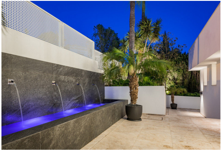
VILLA IN SIERRA BLANCA